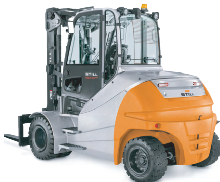
RX 60 6.0 - 8.0 T