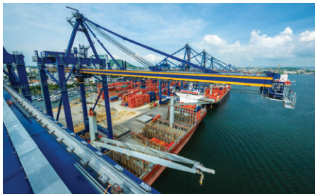
SHIP-TO-SHORE CRANES (QUAY CRANES)