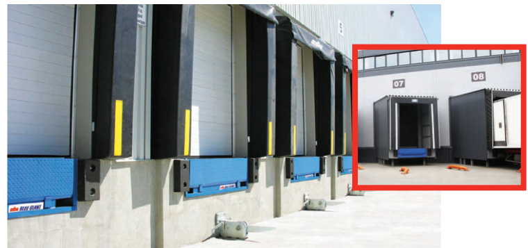
RETRACTABLE DOCK SHELTERS