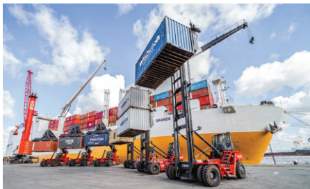
EMPTY CONTAINER HANDLERS

With increasing trade volumes and stricter environmental legislation, marine terminals are facing ever-greater pressure to expand their operations while simultaneously improving efficiency and sustainability. Having understood that, DIMO has partnered with Kalmar Group to bring solutions for port terminal operations as well as for the Inland Container Depot.