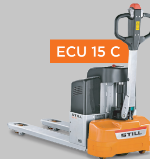
ECU 15 C