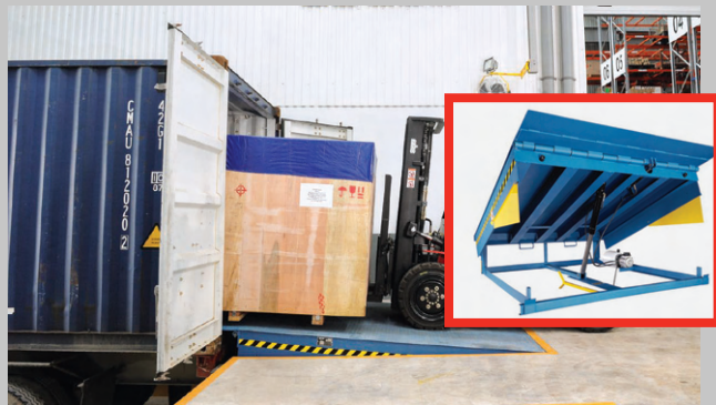
HYDRAULIC DOCK LEVELERS

DIMO brings world-renowned MHE-Blue Giant Docking Equipment as the warehousing and logistics industry in Sri Lanka is evolving like never before and need for docking equipment is also growing. Loading bays provide a bridge to load trucks in logistic hubs, retail outlets, hotels, hospitals, postal services, etc. MHE-Blue Giant's loading bay equipment is known for its quality and reliability, with many testimonies from satisfied customers.