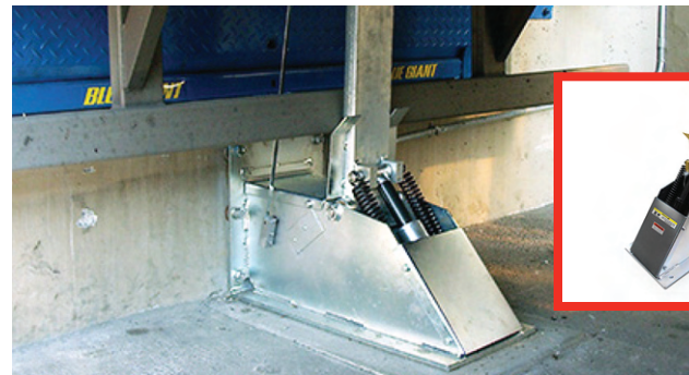
VEHICLE RESTRAINTS (WHEEL CHOCKS)