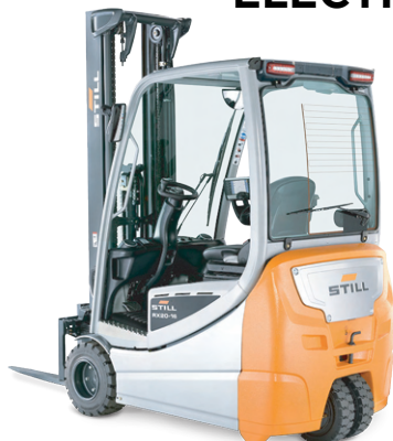
RX 20 1.4 - 2.0 T