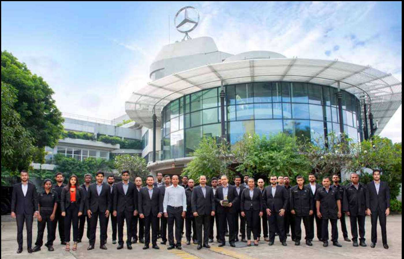
Mercedes-Benz Service Team at DIMO

DIMO has once again earned the prestigious “General Distributor Award” by Mercedes-Benz AG, outperforming others in the region, in the General Distributor category, at the recently held Mercedes-Benz Service Excellence - Regional Award Ceremony. DIMO has created new standards in regional service excellence by gaining a higher Customer Satisfaction Index and Net Promoter Scores. This resulted in DIMO receiving the best Service Excellence Award ranking among the General Distributors in the region.